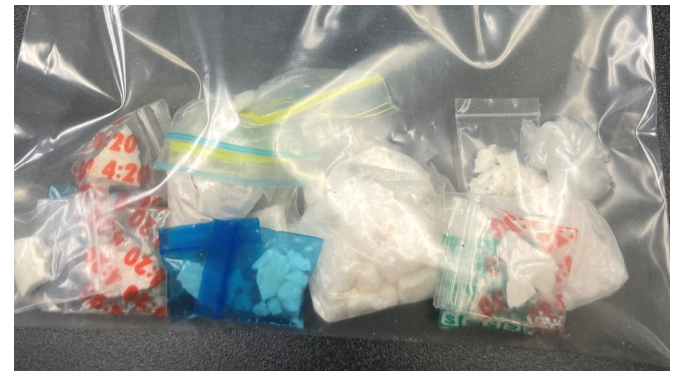
Crack Cocaine Packaged for Resale